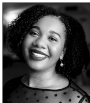
• Kovner Fellow