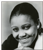
Ruby Elzy, 1942