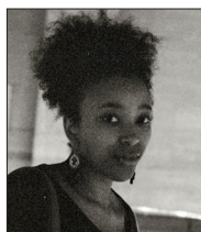
• Frederick Loewe Scholarship in Composition