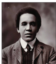
Samuel Coleridge-Taylor, 1905

The 1930s at Juilliard were a period of growing student involvement in the affairs of the school. During this decade, the Juilliard Student Club was founded to enhance the extracurricular activities of students. Dynamics , a Juilliard student publication, was also established.