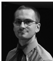
• Kovner Fellow