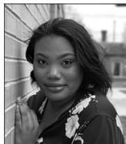
• Allen R. and Judy Brick Freedman Scholarship