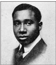
R. Nathaniel Dett, 1923

The 1934 concert was organized by Juilliard students. It is deeply meaningful that Claiming Your Space: Honoring Black Music at Juilliard is fully supported by the entire institution. It reflects the reality that Black music has grown in its presence at Juilliard from extracurricular to curricular.