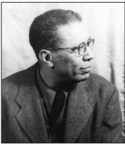
Hall Johnson, 1947

In 1934, it would have been expected that a concert titled The Negro in Music would be a program of only spirituals. Yet the students created a performance that included art and folk songs, instrumental works, and yes, spirituals. Our 90th anniversary tribute, Claiming Your Space: Celebrating Black Music at Juilliard , preserves the historical influence of Black music at Juilliard while also welcoming its new expressions.