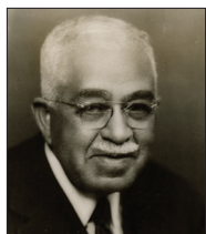
Harry T. Burleigh