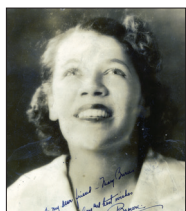
Anne Wiggins Brown